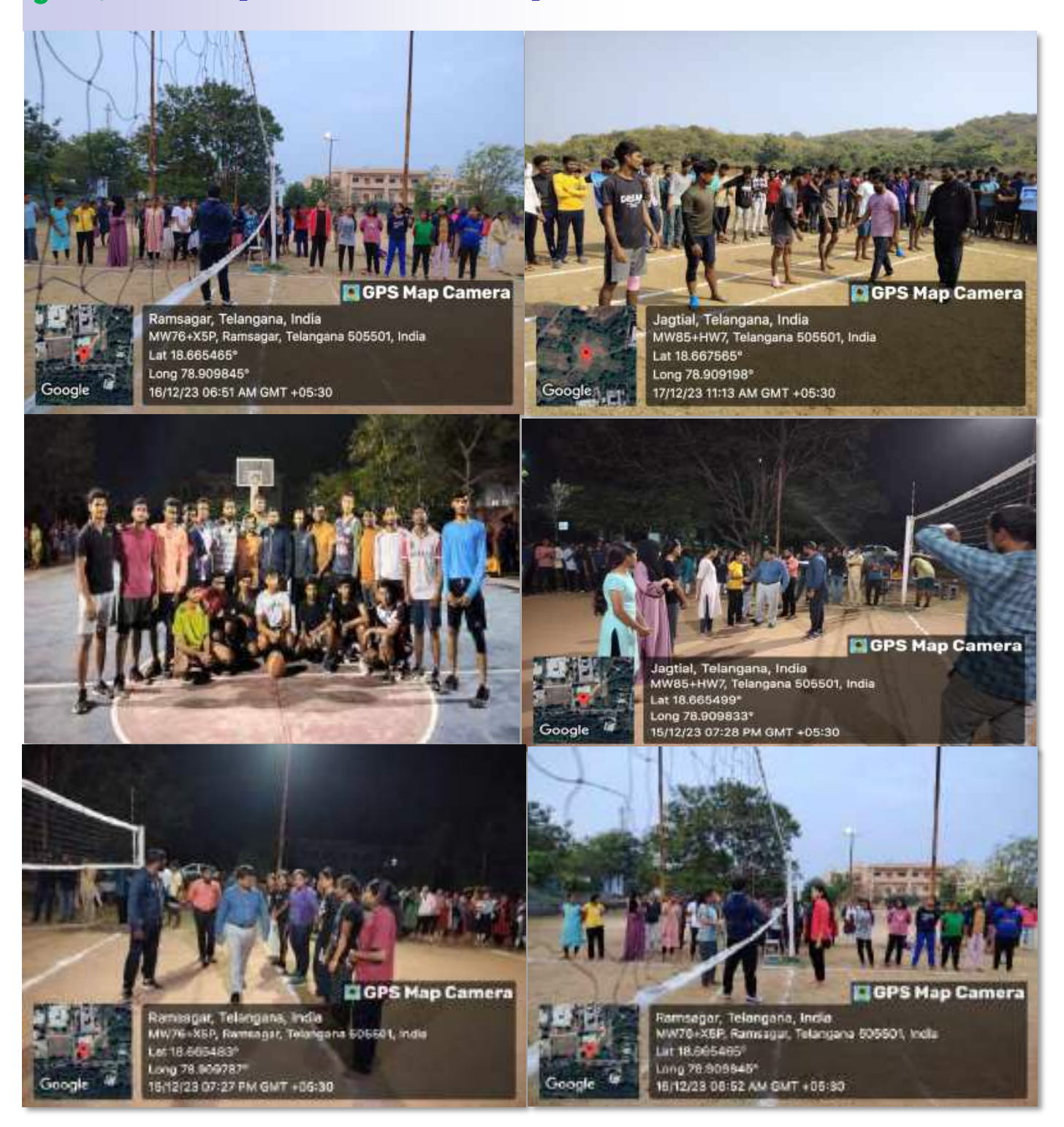
FRESHER'S DAY SPORT EVENTS (15<sup>th</sup> DEC, 2023):

On the eve of Freshers' Day, the campus buzzed with energy as sports enthusiasts and newcomers alike gathered for an exciting array of athletic competitions on December 15th. The sports events included thrilling matches of throwball, volleyball, kabaddi, and basketball, showcasing the athletic prowess and team spirit of our first year students. The courts echoed with cheers and applause as participants exhibited their skills and camaraderie. These sporting events not only added a dynamic touch to the Freshers' Day festivities but also served as a platform for new students to integrate into the vibrant sports culture of our campus. Congratulations to all the participants for making the sports events a memorable and spirited part of our Freshers' Day celebrations!