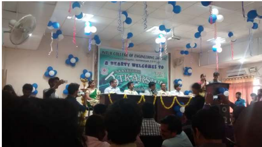
Inaugural Function of Saankethic Utkarsh 2016