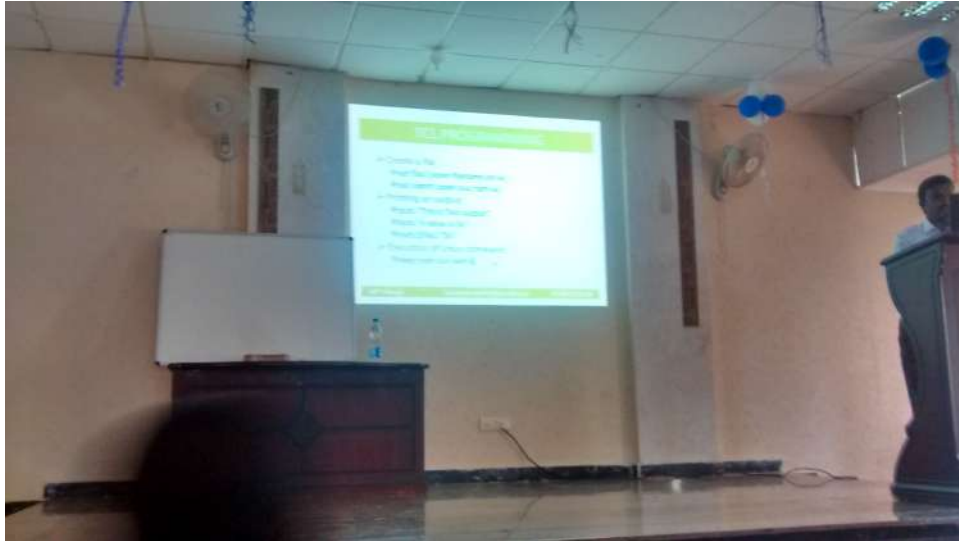
NS-2 Workshop organised by ECE Department during Saankethic Utkarsh 2016