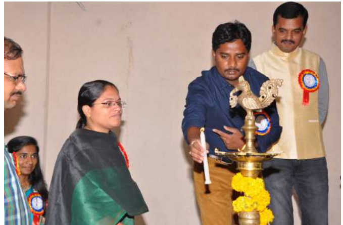
Lighting of Lamp