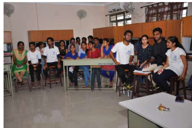
Students of Various Engg. Colleges Participating in Technical Quiz organised by IETE Students Forum