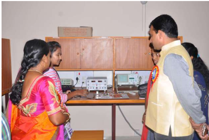
Students participating in Project Presentation