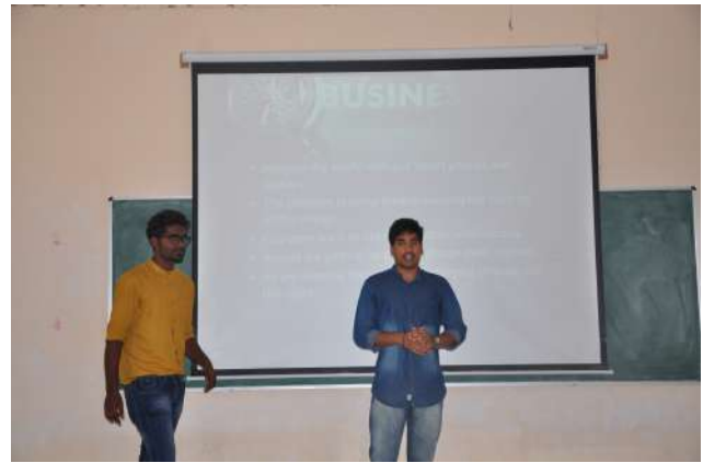
Students of MLRITM, Hyd. Participating in Paper Presentation