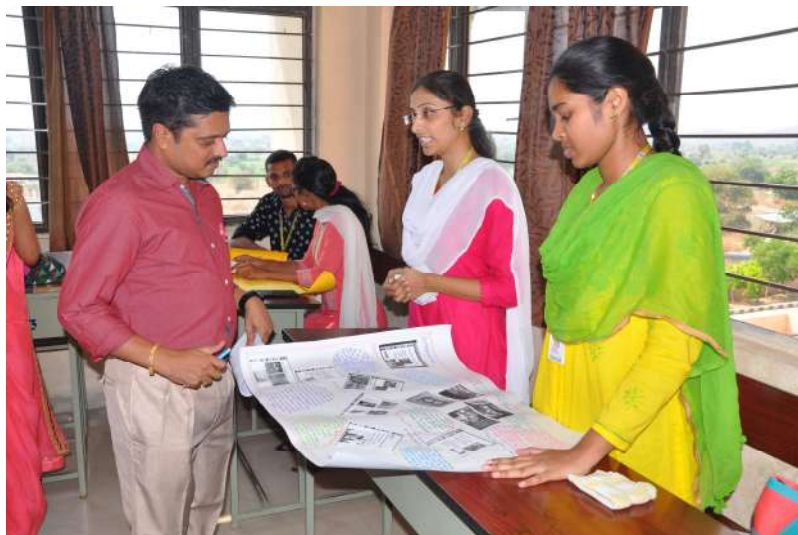
Students participating in Poster Presentation