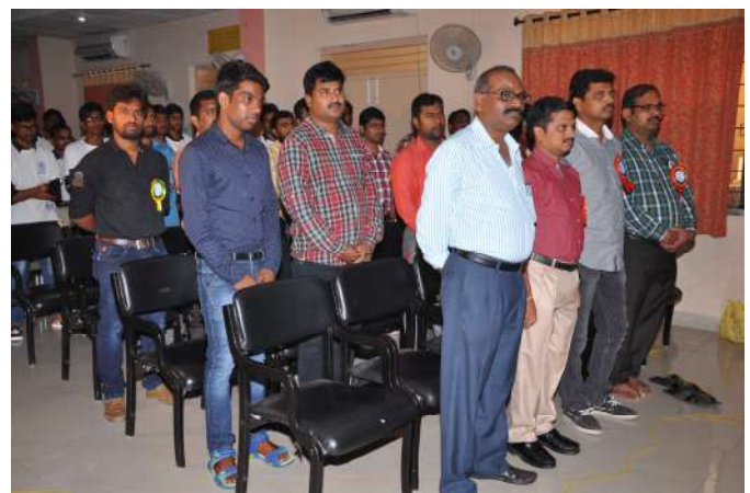
Chief Guest, Faculty and Participants Stand up for the Prayer Song