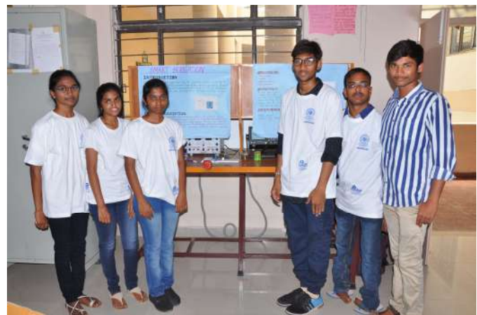
Students of JNTUH CEJ explaining their Projects in Exemplitia (Junior Expo)