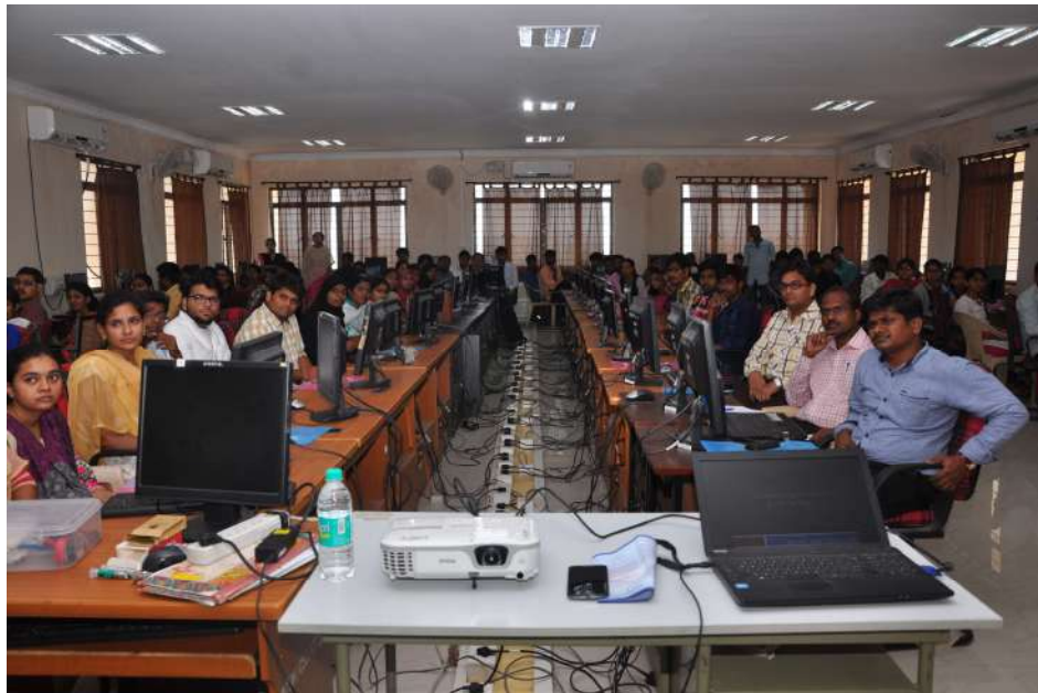
Hands-on Raspberry Pi Workshop Participants seated in Simulation Lab of ECE Dept. during the Workshop